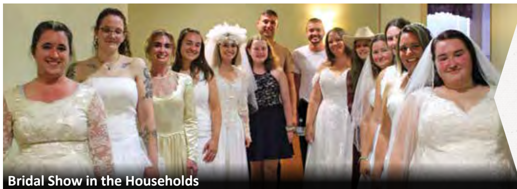
Bridal Show in the Households

Chapel Pointe has a great team of staff who use their talents, passions, and resources to make each day meaningful for our residents. These pictures highlight just a few recent events when staff stepped out of their "typical" roles to make the extraordinary possible.