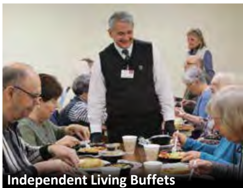
Independent Living Buffets