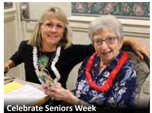
Celebrate Seniors Week