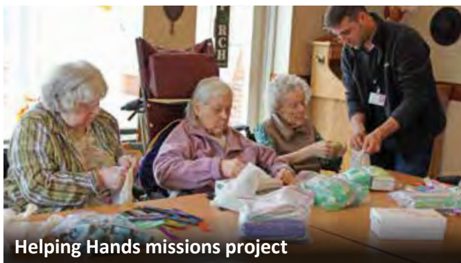
Helping Hands missions project

www.ChapelPointe.org/donate or scan the QR code above.