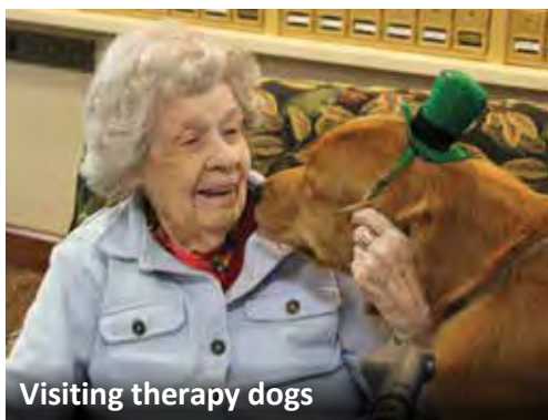
Visiting therapy dogs