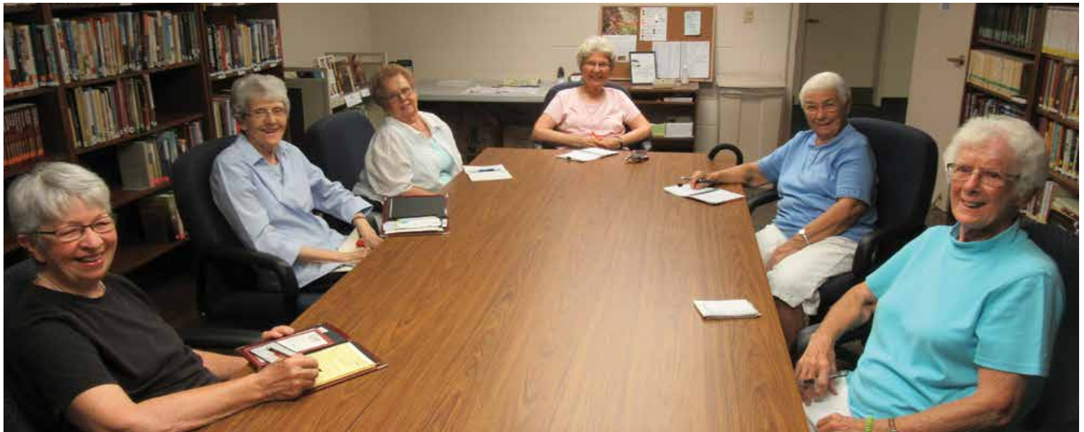
Independent Living residents gather for prayer and devotions.