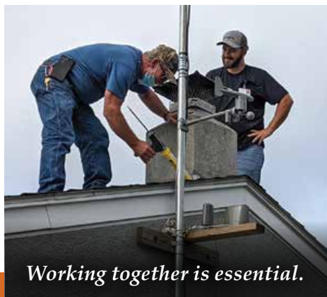
Working together is essential.

At Chapel Pointe, we strive to hold God’s love at the center of all we do because it draws us to a higher standard of living, unites us together, and reaps a harvest of blessings.