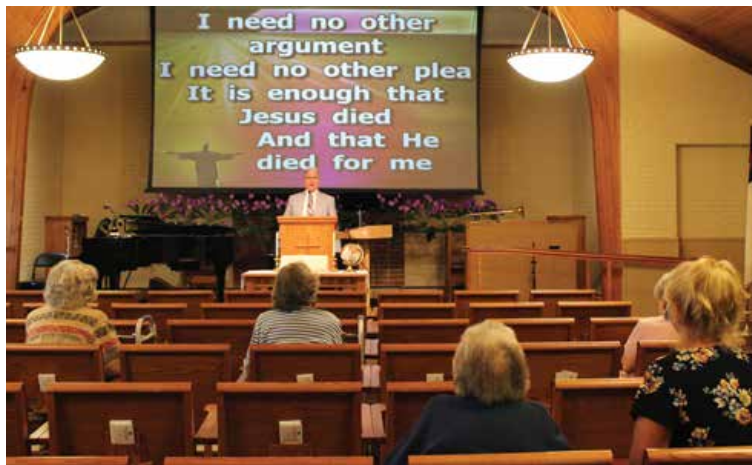
Personal Care residents gather for devotions.