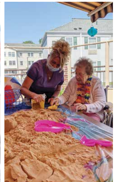
Staff host a luau for Family Place residents.